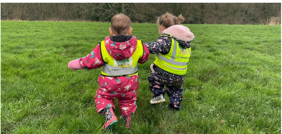
Baby Bees enjoying their Walk and Talk