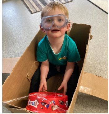
Busies learning about recycling